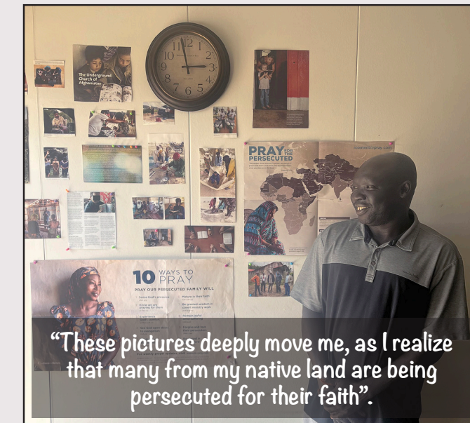
"These pictures deeply move me, as I realize that many from my native land are being persecuted for their faith".

"I discovered the wonders of this new place and I began to live