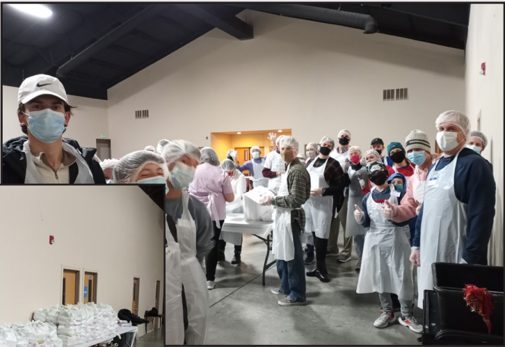
MagnaFact Pantry, C.C.M.S Church Outreach, Nations for Christ “City of Hope”, Valley Behavioral Health, Mosaic Interfaith, and Little Minds Day Care.

We were able to accomplish this by delivering food to other local service providers which included: